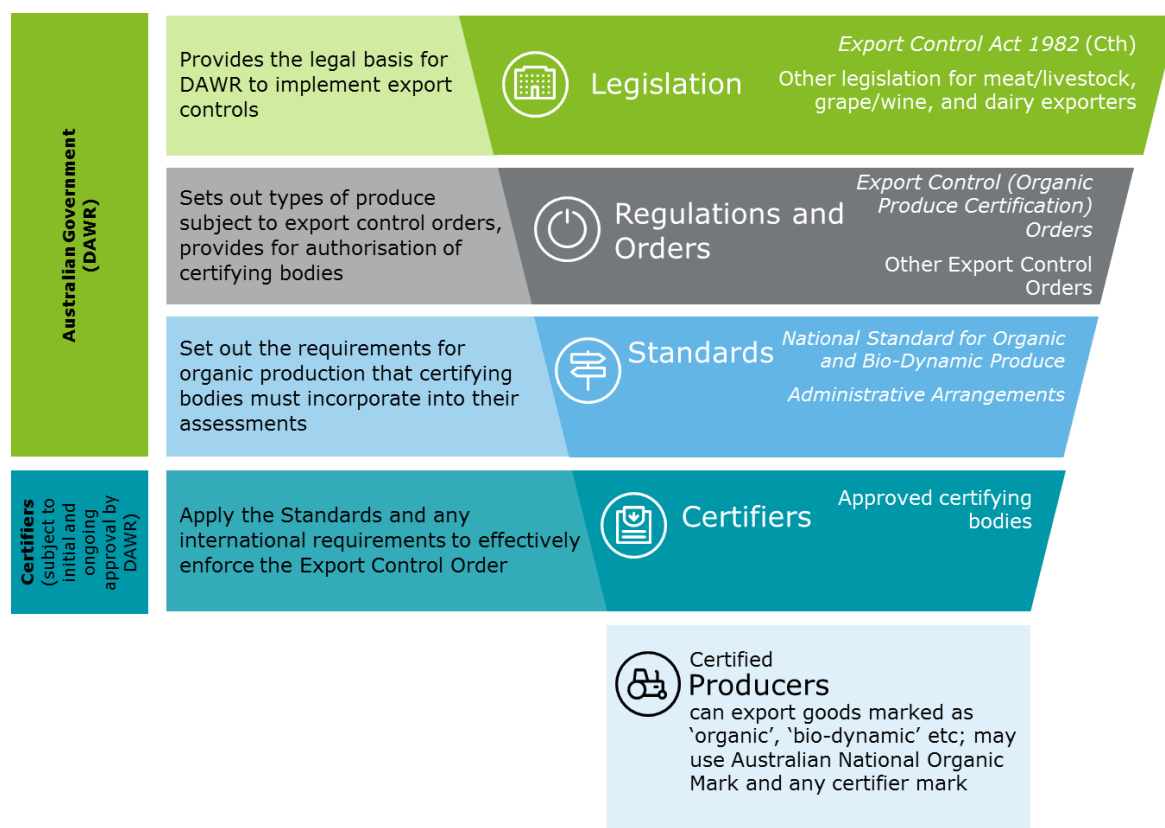
Figure 3 Regulatory regime for organic exports

The Export Control Act 1982 (Cth) ('the Act') provides the basis for the Australian government to regulate the export of certain goods from Australia. The Act is administered by the DAWR. Legislative instruments called Orders, made under the Act or regulations, specify requirements for exporting particular goods. This legislation aims to establish greater credibility for Australian